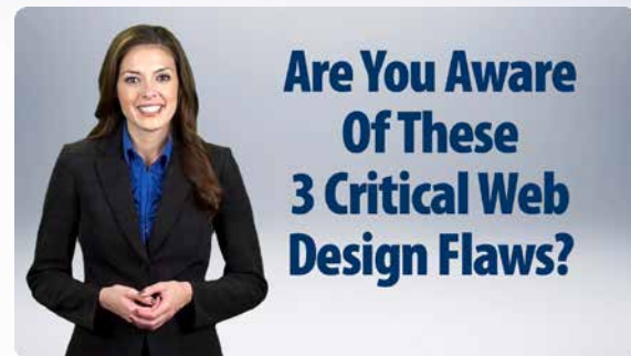
This is the EXACT SAME video hosted on our website with a customized thumbnail. (Yes, it has rounded corners on the video.)

At Power Marketing, we host our client's videos for them and triple encode all of our videos for our clients so that they play back seamlessly in HD (high definition), SD (standard definition), and on mobile devices without forcing visitors to leave the page. And yes, they work perfectly on iPads and iPhones, everytime—even when streaming over cellular networks. Additionally, we always custom create a video thumbnail so that visitors to your website will want to push play and actually watch your video.