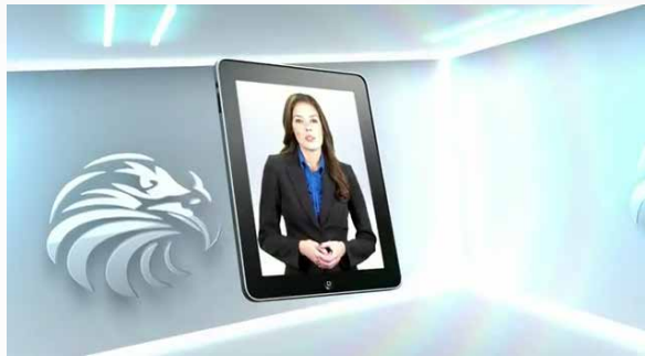
This is the actual thumbnail for one of our videos on YouTube (the thumbnail is generated by YouTube).

our website. Which one would you be more inclined to click and watch?